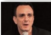
Hank Azaria, Actor