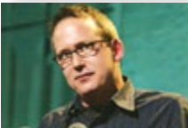
Ted Hope, Producer