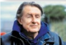
Joel Schumacher, Director