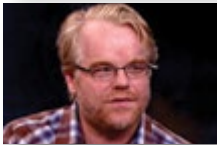
Philip Seymour Hoffman, Actor