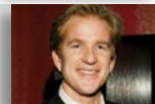
Jon Voight, Actor