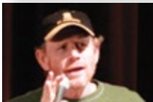
Ron Howard, Director