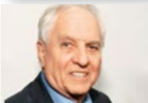
Garry Marshall, Producer/ Director/ Writer/ Actor