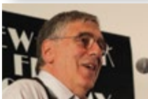
Eliot Gould, Actor