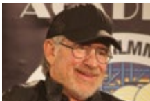
Steven Spielberg, Director