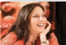
Mira Nair, Director