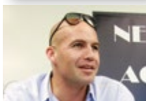
Billy Zane, Actor