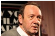
Kevin Spacey, Actor