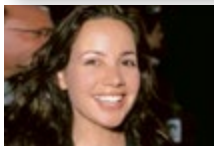
Janeane Garofalo, Actress