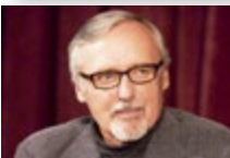
Dennis Hopper (1936 – 2010), Actor