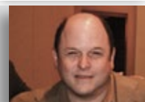
Paul Haggis, Writer/ Director