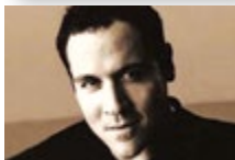
Jon Favreau, Director/Writer/Actor